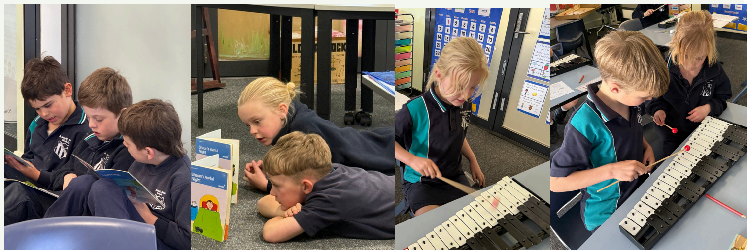
Reading groups in Year 1